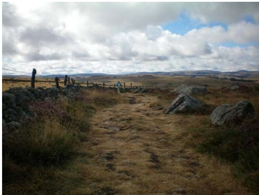
Under an immense sky